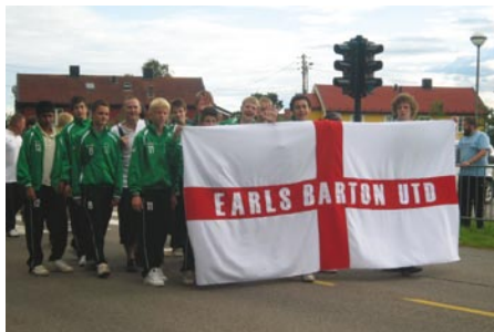
The opening parade of the tournament in the streets of Oslo

We chose the Norway cup for various reasons. Firstly it fitted in with the school holidays, it is a country few boys would ever visit, having experienced Denmark's Dana cup previously the tournament organisation is superb and finally after the boys being scared of the Scandinavian girls at 11 and 12 it would be nice to revisit at 14 and 15!